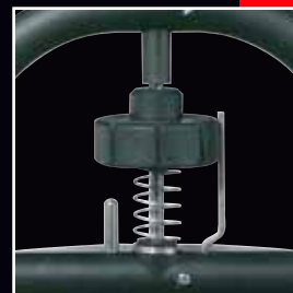
Adjust your exact dosage quantity