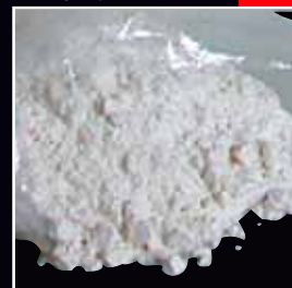
Silex® Premium waffle mix