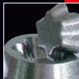
Waffle accessories, full aluminium casting, ball polished