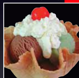
Ice cream basket (made in basket shaper)