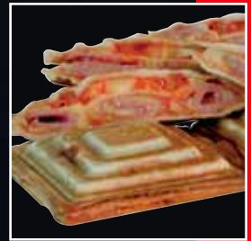
Finished jaffle, toasty, snacky or your sealed health food fun