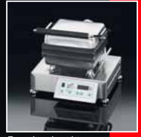
Functional and aesthetic design

Grill-Machines Waffle-Bakers Snack-Concepts