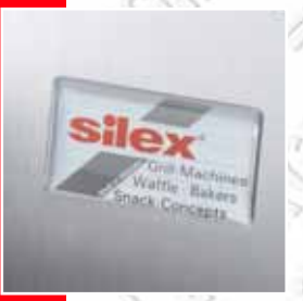
Brushed stainless steel