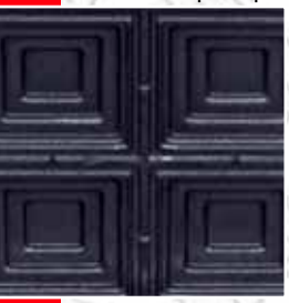
Baking plates, heavy-duty cast iron