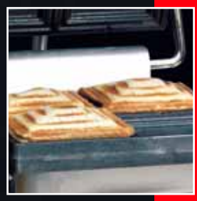
4 hot snacks in up to 2 minutes!