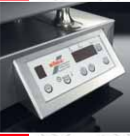
Electronic panel with TouchScreen principle