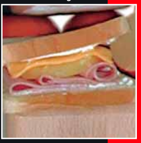
Fill your toast to your liking