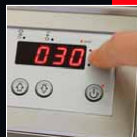
Simple work by touch