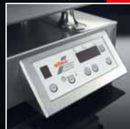
Electronic panel with TouchScreen principle