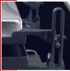
Self adjusting height of top plate