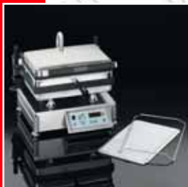
Accessories and video-DVD included

Available in 3 versions with cast-aluminium plates: GTTPowerSave®10.10: flat / flat GTTPowerSave®10.20: grooved / grooved GTTPowerSave®10.30: grooved / flat