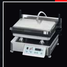
Functional and aesthetic design