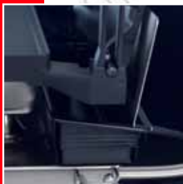
Grease drip tray (removable)