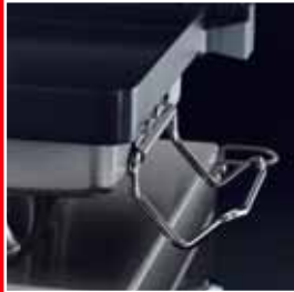
Sandwich spacer wings*