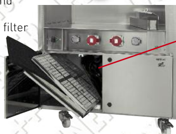
Fan motor unit

Re-usable dual-cassette odour filter, filled with zeolite and additional active carbon filter