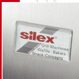
Brushed highest grade stainless steel