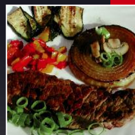
Quality preserving and energy saving grilling technology