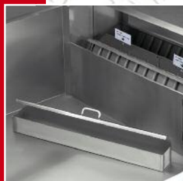
Grease collection tray